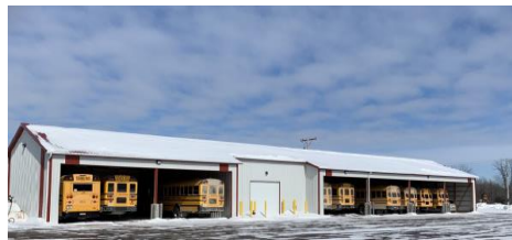
Bus Barn in 2018