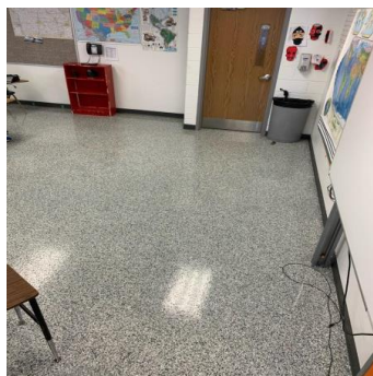
Middle School Flooring