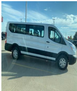
12 Passenger Van