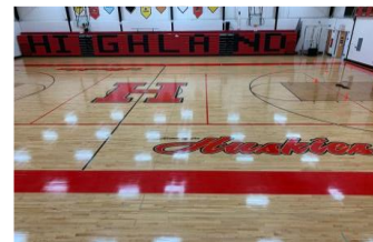
High School Gym Floor