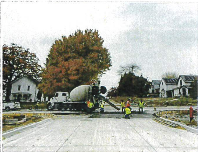
Photo of Streb pouring intersection at 3rd and Washburn; Concrete paving has been completed throughout Phase 2;