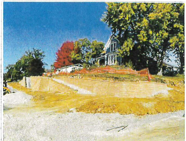
Hardscape Solutions has completed Wall 7 which was the final wall to complete the retaining wall system located at 3rd and Greene Street